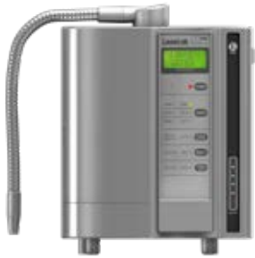
LEVELUK SD501 PLATINUM