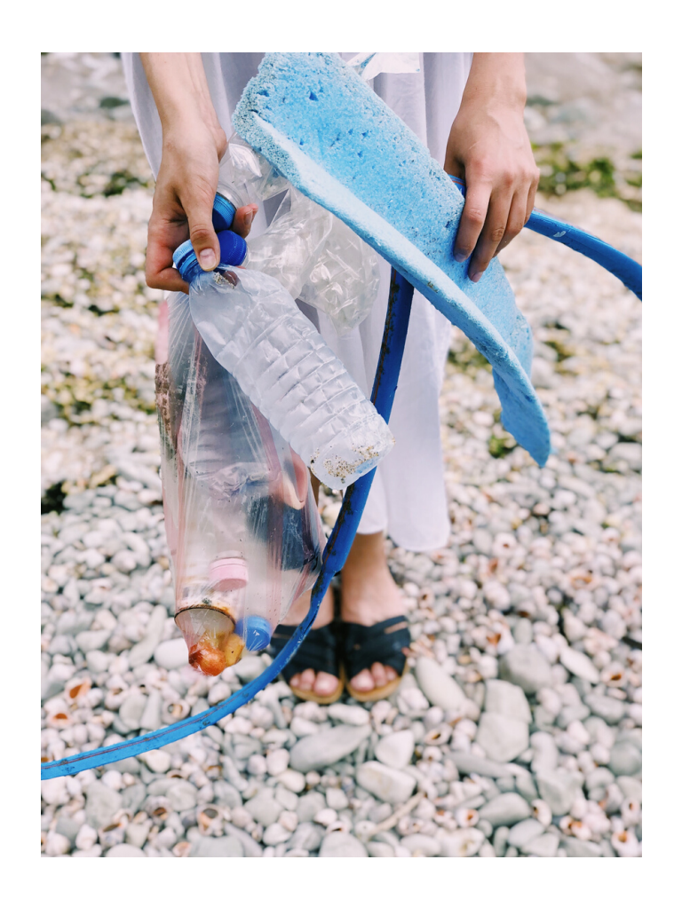
Congratulations on investing in your health and reducing toxicity in the environment.